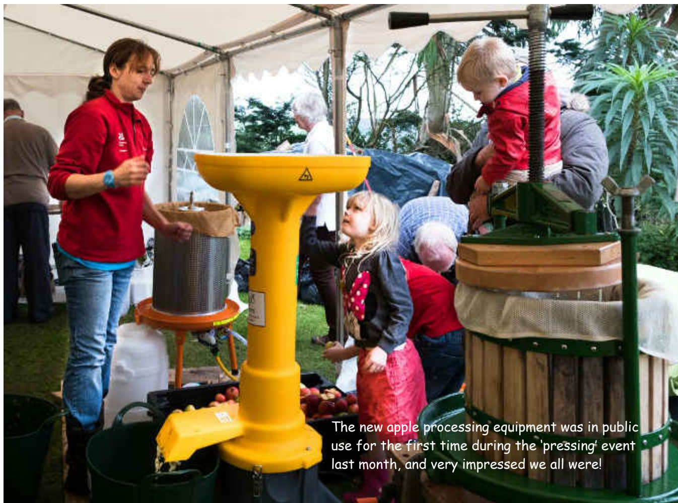
The new apple processing equipment was in public use for the first time during the 'pressing' event last month, and very impressed we all were!