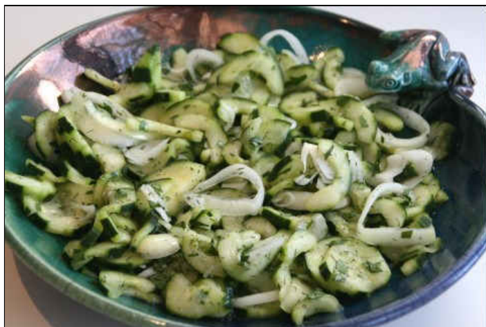
Swedish Cucumber Salad with Dill and Parsley

2017 dates: No August meeting, 21 September, 19 October 16 November